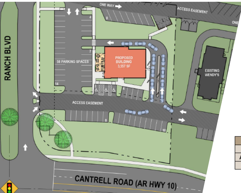
PROPOSED SITE LAYOUT LOT B7